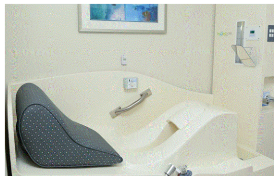
Figure 1: HyGleaCare system.

HyGleaCare Prep provides an FDA cleared colon irrigation system to replace the traditional oral prep (Figure 1). It is intended for use when medically indicated, such as before radiological or endoscopic examination. The HyGleaCare Prep is private, low-pressure, warm water, odorless, well tolerated and effective.