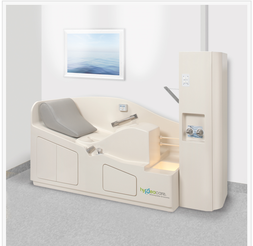
odorless and acoustically protected HyGleaCare experience